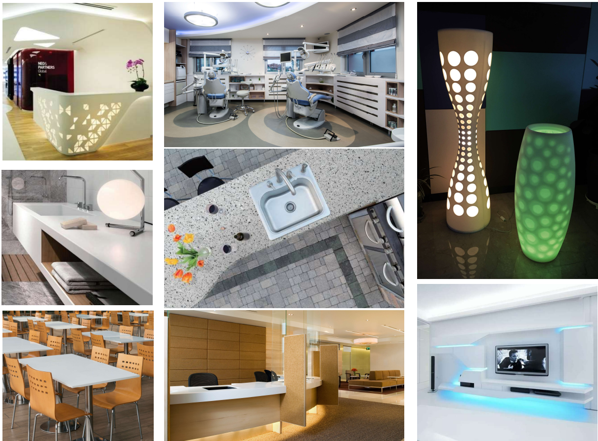
Figure 1: TriStone™ in its various applications